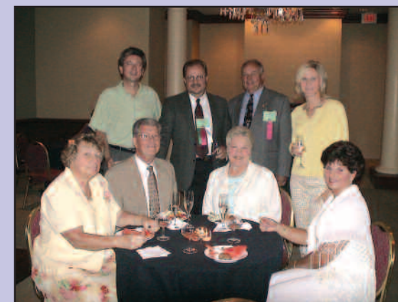
PCI Members at a recent Homecoming reception.